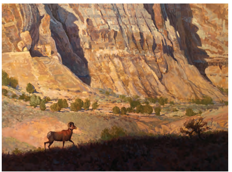
"Desert Bighorn in San Rafael," oil on canvas, 48" x 60"